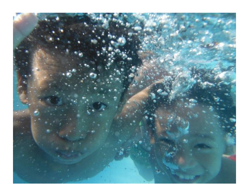
Thank you from the little kids in Vietnam.

More information on WSV can be found on our website <a href="www.watersafetyvietnam.com">www.watersafetyvietnam.com</a> or follow and like us on Facebook.